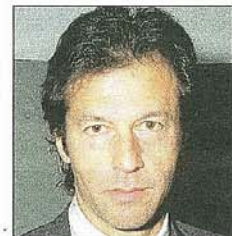
Imran Khan: Guest

The hospital needs funds because 70 per cent of patients are treated free.